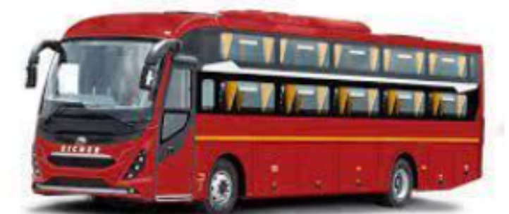
Bus- helpful in transportation