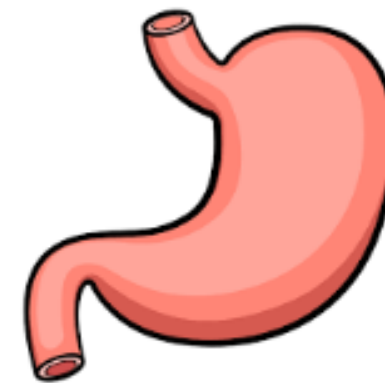
Stomach- helps in digestion of food by grinding it