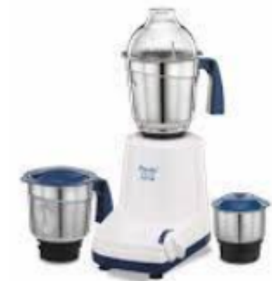
Mixie- grinds all the ingredients